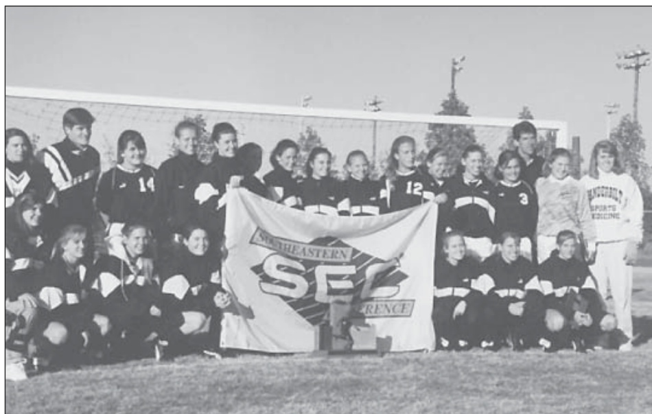
Vanderbilt won the first SEC soccer championship in 1993