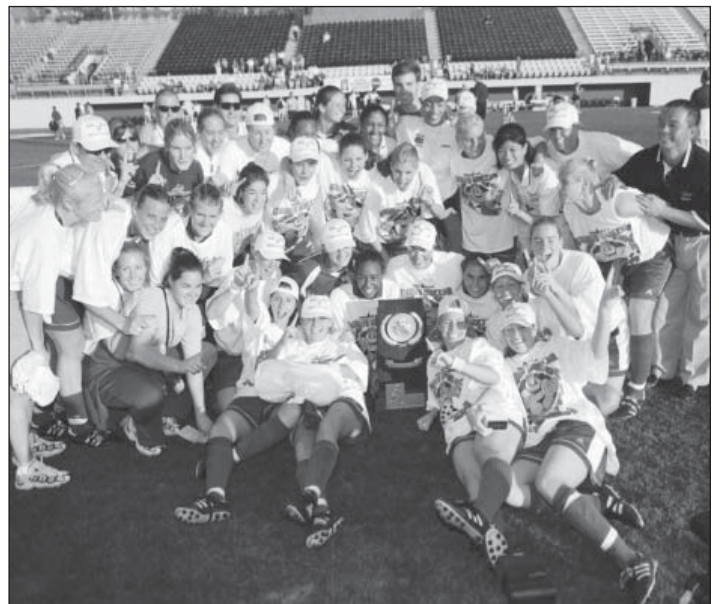
Florida celebrates after winning the 1998 NCAA Division I Women's College Cup, 1-0, over North Carolina

*Participation before team was a member of the SEC